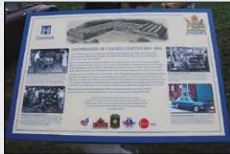
The commemorative plaque at the corner of Mars Avenue and Wentworth Street in Hamilton. For a better view of the plaque, go to: http://www.thehamiltonchaptersdc.ca/Studebaker%20Plaque%20FINAL.jpg .