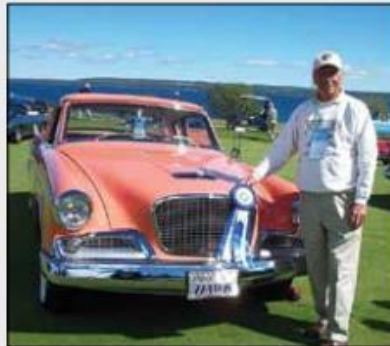
The '61 Hawk - First in Class at Cobble Beach Concours.